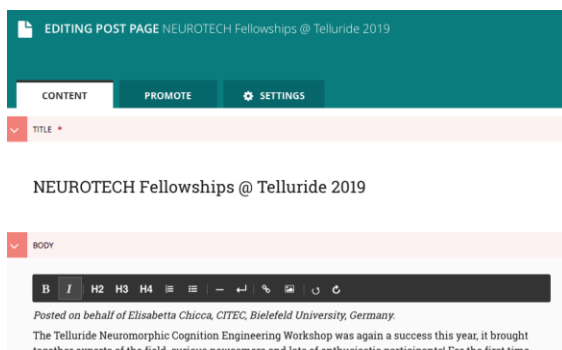
Fig.3: the blog editor.